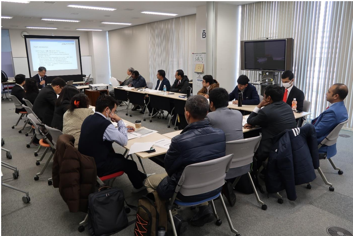
Special Lecture by Local Tax Agency