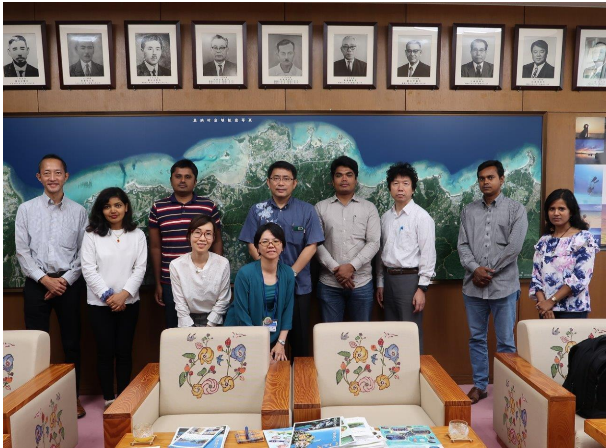
Special Lecture at Onna Village Office, Okinawa