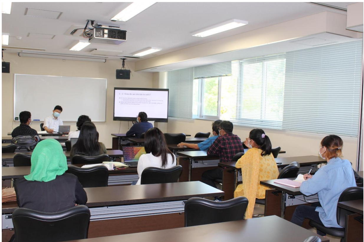
Regular Lecture at the Research Building