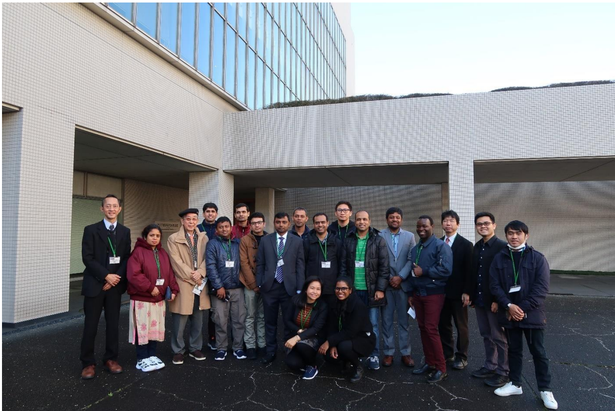
Visiting the IDE Library, Institute of Developing Economies Japan External Trade Organization